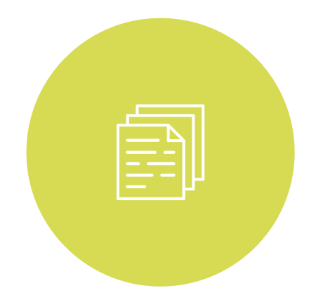
Advocacy and regulations

Regulatory and policy framework in Slovakia and EÚ